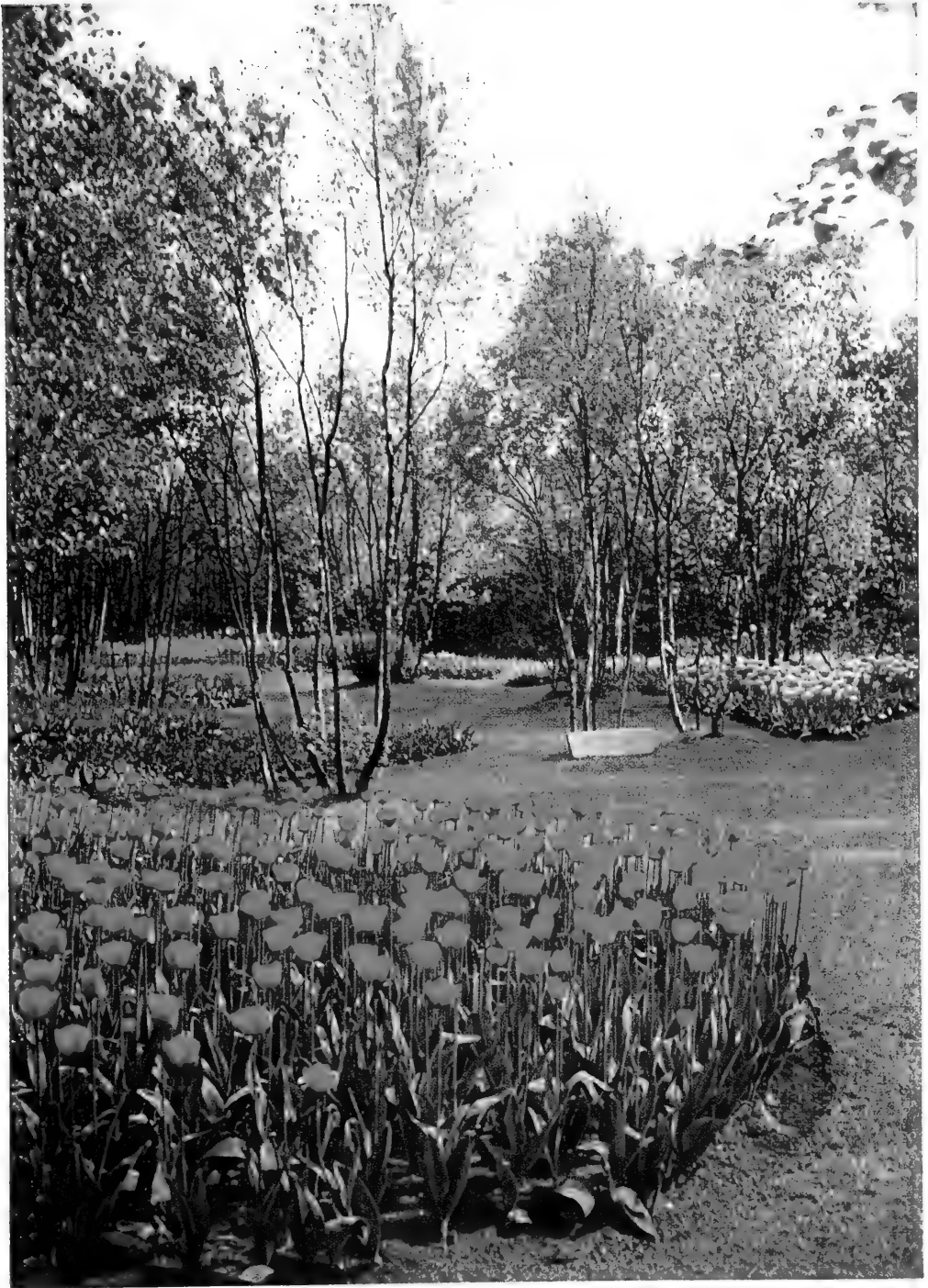
GLORIOUS PLANTING OF TULIPS